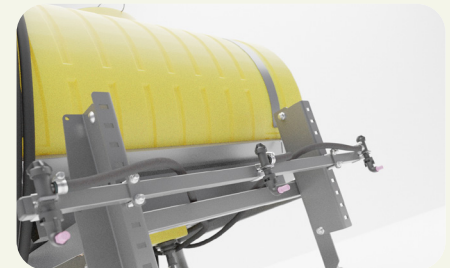
30' Boomless Spray Bar