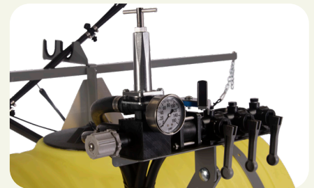
A6B Manual Controls