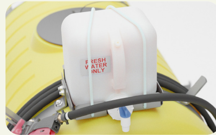
Safety Rinse Tank